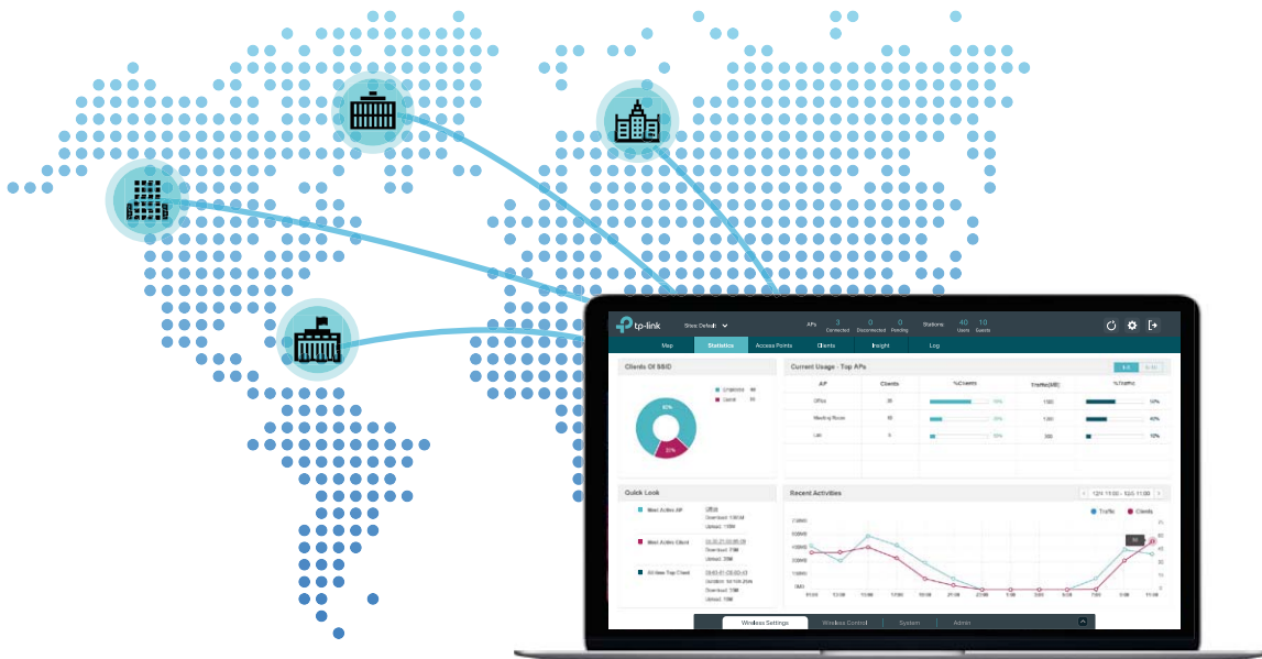
Omada Controller Software