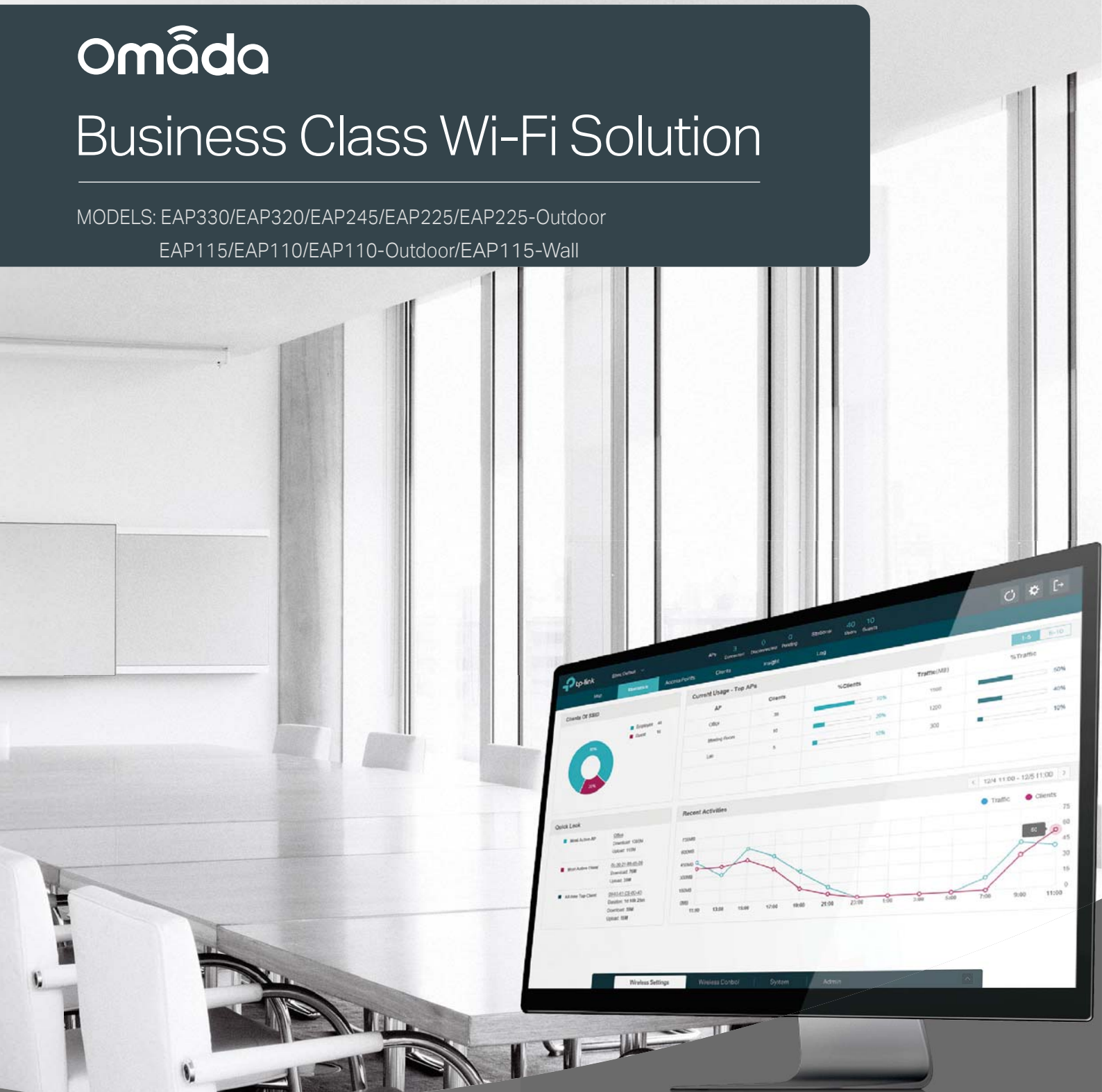
Omada Controller Software

MODELS: EAP330/EAP320/EAP245/EAP225/EAP225-Outdoor EAP115/EAP110/EAP110-Outdoor/EAP115-Wall