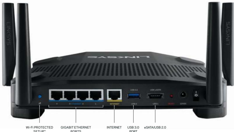
Wi-Fi PROTECTED SETUP™ GIGABIT ETHERNET PORTS INTERNET USB 3.0 PORT eSATA/USB 2.0

Input: 100-240V ~ 50-60 Hz Output: 12V/3A