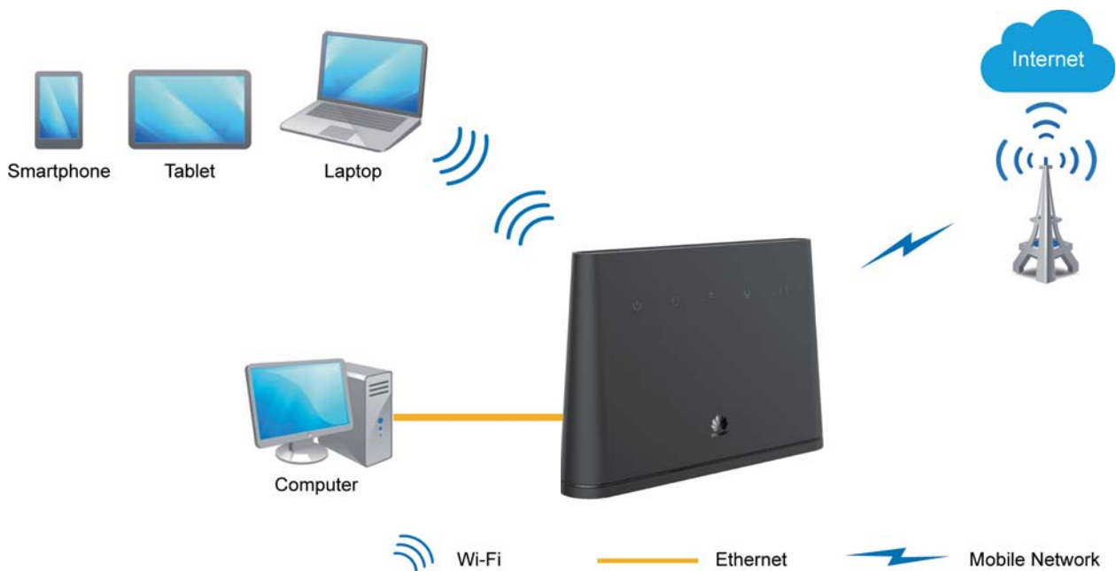
Figure 4-1 Accessing the Internet through a mobile network

The B310s-22 can access the Internet through mobile networks.