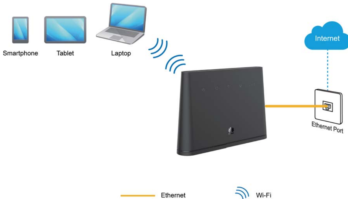
Figure 4-2 Accessing the Internet through an Ethernet network

Connect the B310s-22's WAN/LAN port to a wall-mounted Ethernet port using a network cable.