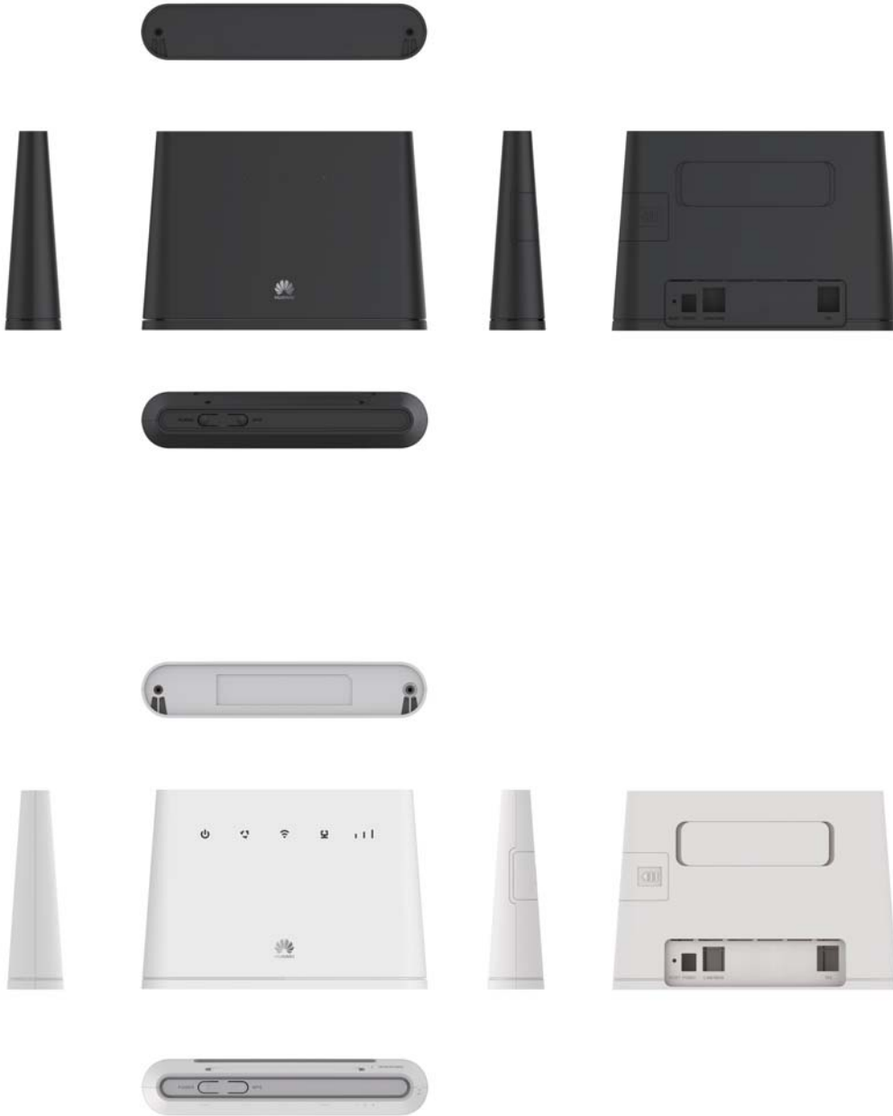
Figure 1-1 B310s-22 appearance